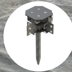
WavePlate™ ArmourMate™ Node Intersection

WavePlate's fully supported and encapsulated disruptive plate technology provides automated MHE and LGV with the smoothest possible transition over joints.