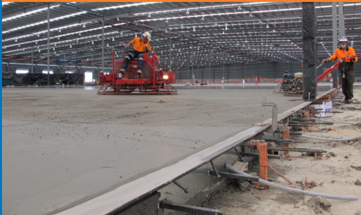
Plate 60 ArmourMate™, Hyper ArmourMate™, Flanged Dowel Box